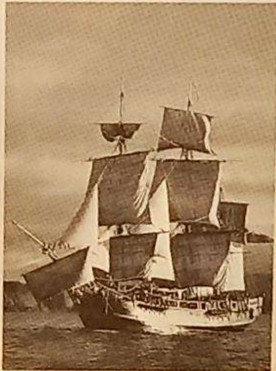
The ship moved slowly out to sea.

A sailor, John Adams, laughed. 'That's right, Mr Christian, sir,' he said. 'Good food, warm sun,